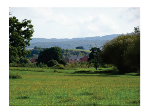
Looking south east from Cheddon Fitzpaine over land allocated for Monkton Healthfield Country Park.