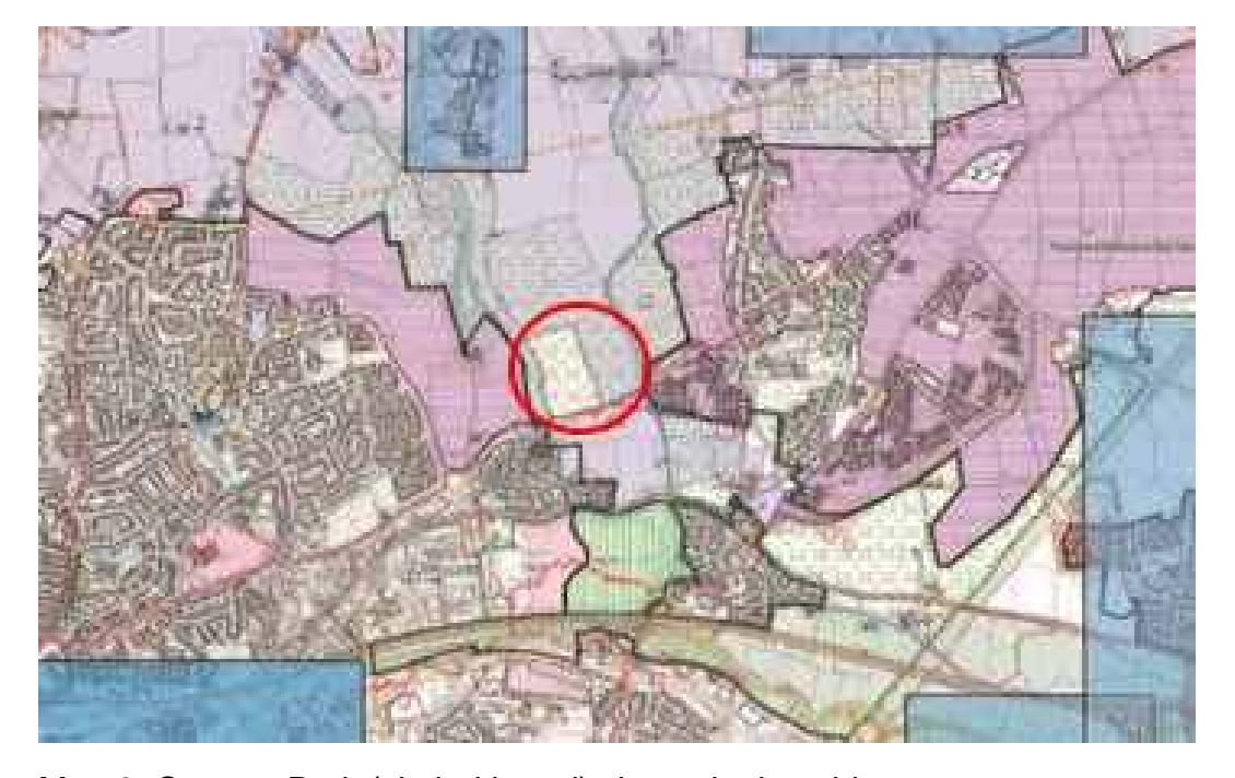
Map 2: Country Park (circled in red) shown in the wider context