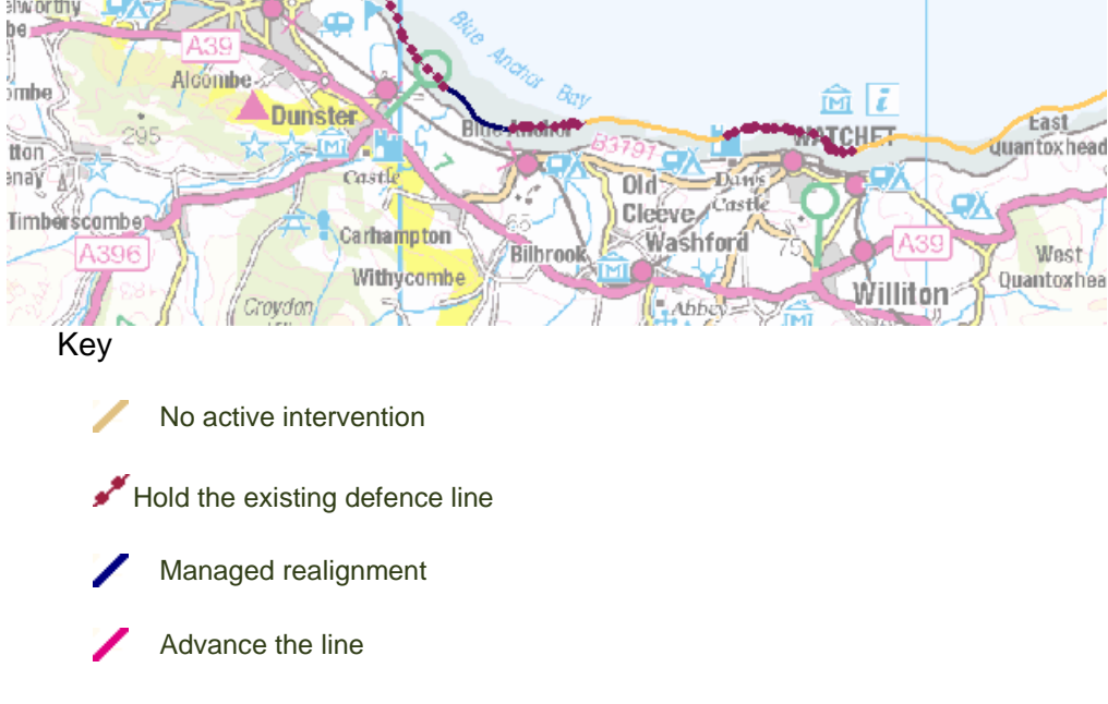
Figure 3 - 1: Coastline Subject to Erosion (Extract from the Environment Agency Website) в A REPAIR A D shworthw