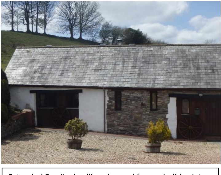
Extended Family dwelling changed from a holiday let