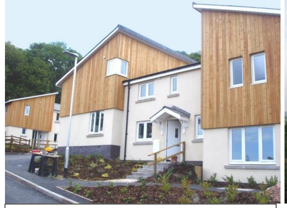
Porlock, Chadwyck Close, 15 dwellings (13 affordable rent, 2 shared ownership).

Another option is shared ownership where the occupier pays a mix of rent / mortgage.