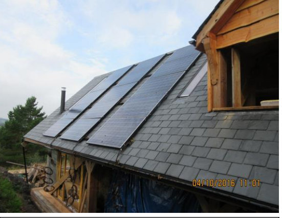
Exton, Self-build local affordable home under construction (2016)